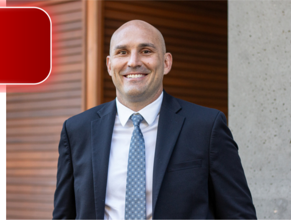
Candidate for Oregon Attorney General

Second, Oregon has a soft-corruption problem. Oregonians increasingly don't trust our elected leaders nor how our taxpayer dollars are spent. As Attorney General, I will investigate the misuse of taxpayer funds and crack down on public corruption.